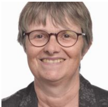
Molly Scott Cato