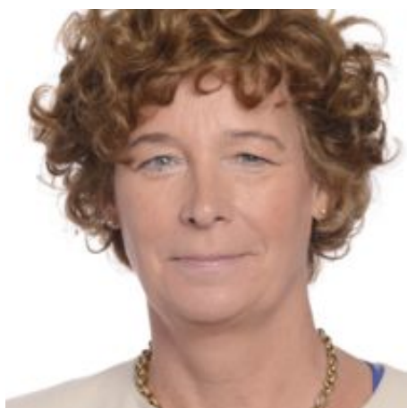
Petra De Sutter