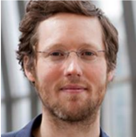
Jan Philipp Albrecht