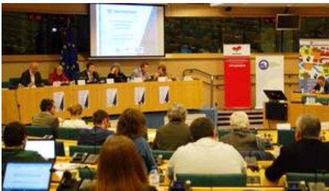
Basque Friendship Group in the European Parliament

MEPs have called for the Spanish government to enter into dialogue in the search for a lasting peace, with EU support if necessary.