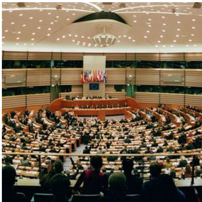
Architecte : Association des architectes du CIC : Vanden Bossche sprl, C.R.V. s.a., CDG sprl, Studiegroep D. Bontinck