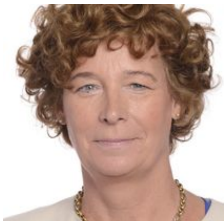
Petra De Sutter