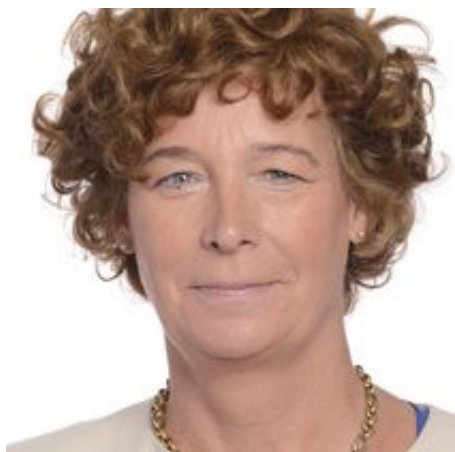
Petra De Sutter