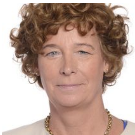
Petra De Sutter