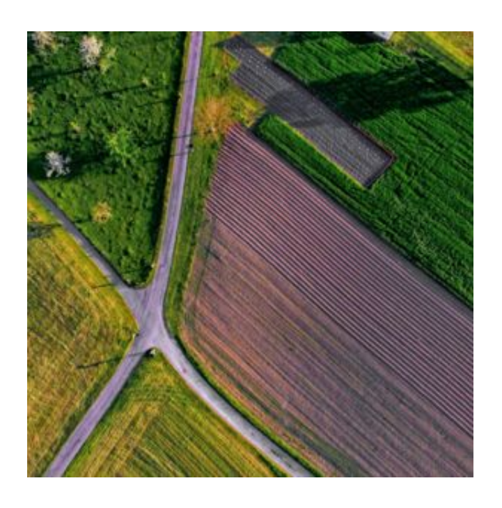
Simplification must not come at cost of climate