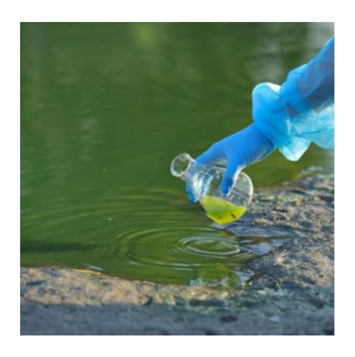
PFAS in Wine, Water & Makeup: How We Can Ban Forever C...