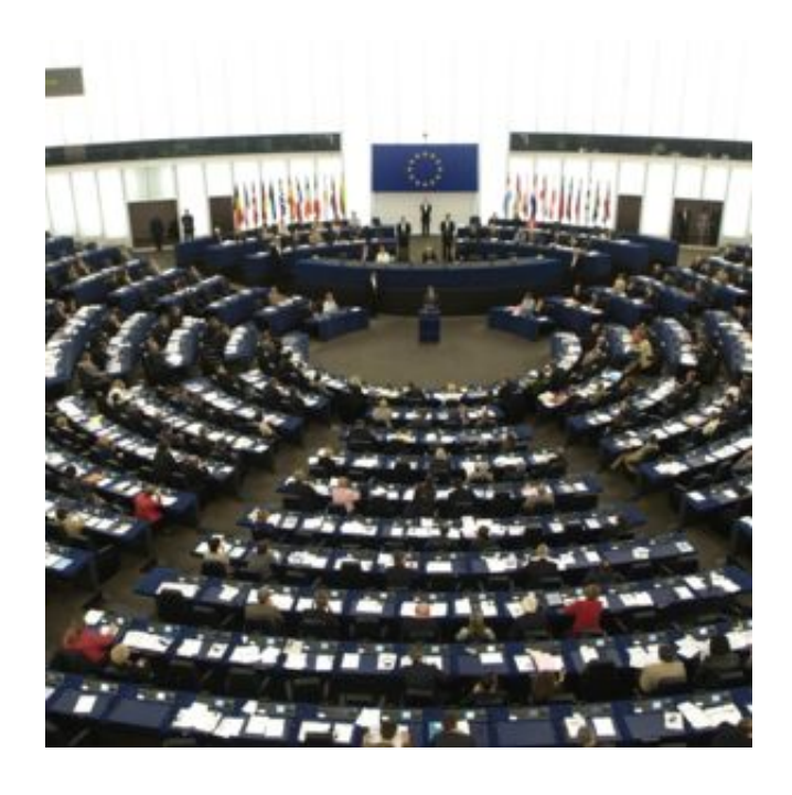
Plenary Flash 16 - 19 December 2024