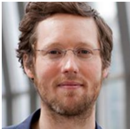
Jan Philipp Albrecht