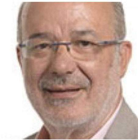
Josep Maria Terricabras

EFA President and first Vice President of the Greens/EFA Group