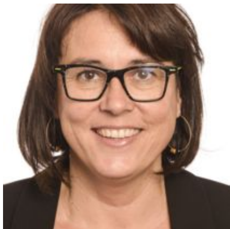
Diana Riba i Giner