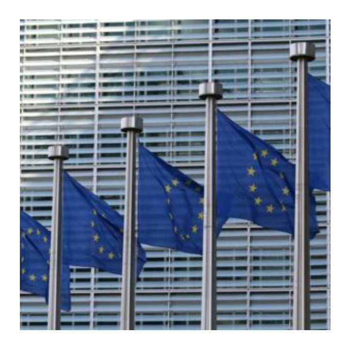
EUCO: EU Strategic Agenda needs to focus on climate ch...