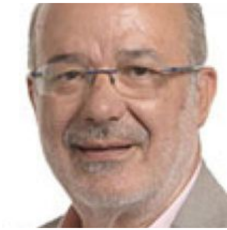
Josep Maria Terricabras

EFA President and first Vice President of the Greens/EFA Group