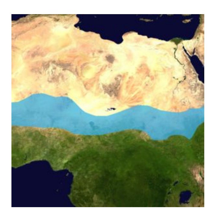
A rethink of the EU's strategy in the Sahel