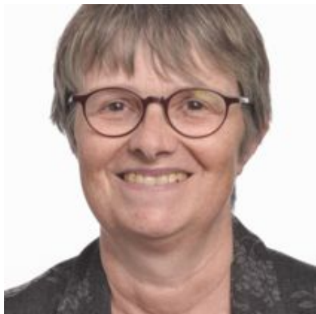
Molly Scott Cato