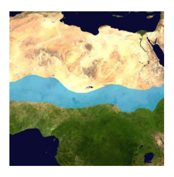
A rethink of the EU's strategy in the Sahel