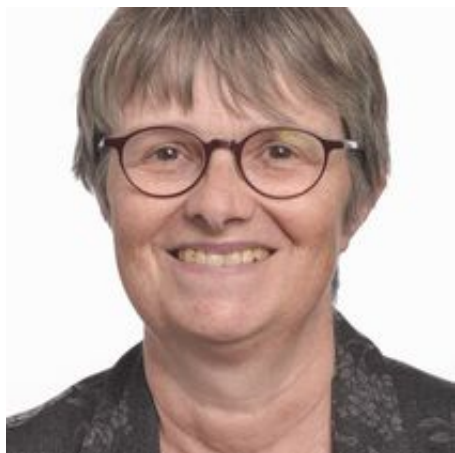
Molly Scott Cato