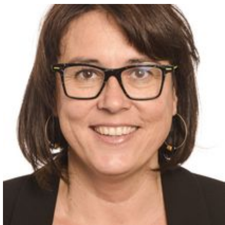
Diana Riba i Giner

EFA President and first Vice President of the Greens/EFA Group