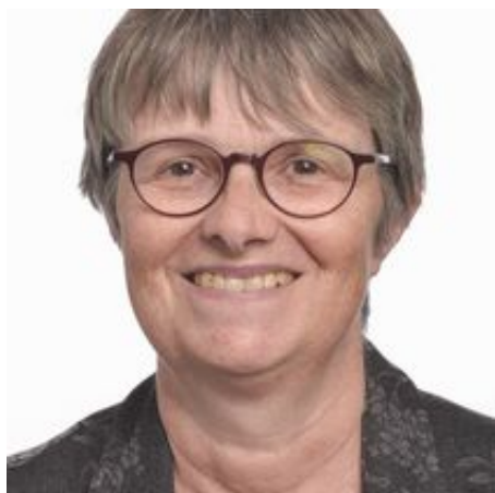
Molly Scott Cato