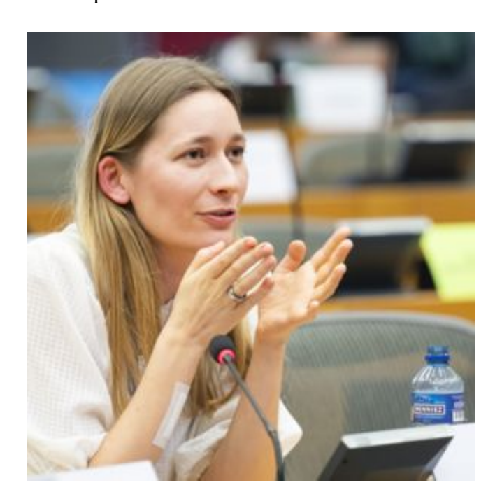
Apple ECJ tax ruling