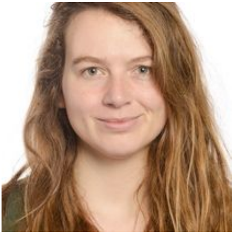
Kim Van Sparrentak