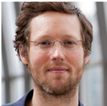
Jan Philipp Albrecht