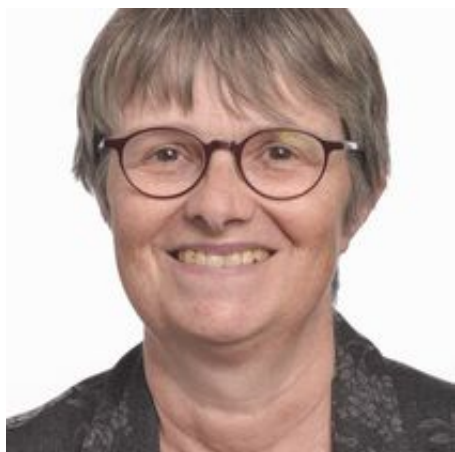
Molly Scott Cato