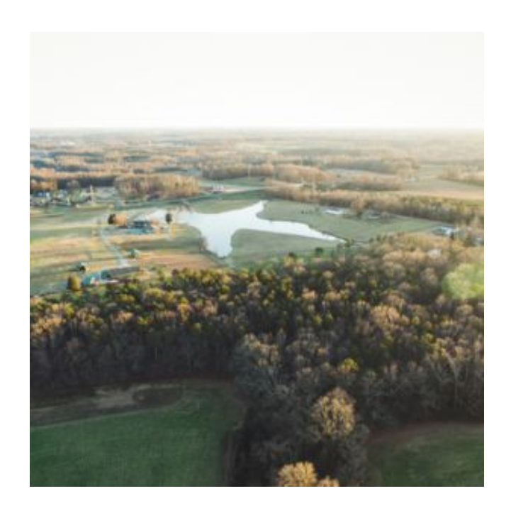
Greens/EFA condemns Commission and MEPs' attempts to r...