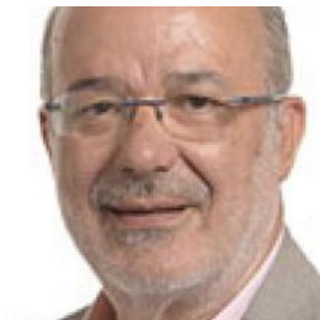
Josep Maria Terricabras

EFA President and first Vice President of the Greens/EFA Group