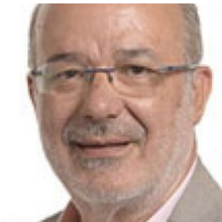
Josep Maria Terricabras

EFA President and first Vice President of the Greens/EFA Group