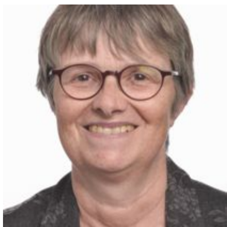
Molly Scott Cato