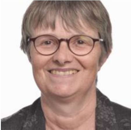
Molly Scott Cato