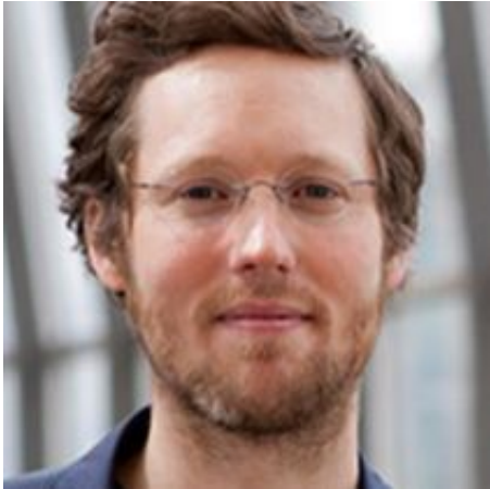
Jan Philipp Albrecht