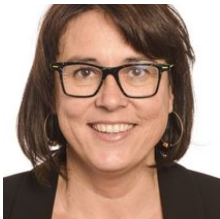
Diana Riba i Giner

EFA President and first Vice President of the Greens/EFA Group