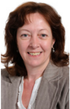
MEP Jill Evans

Plaid Cymru MEP Jill Evans is using a new online tool which will publish details of any meetings she has with lobbyists as and when they happen.