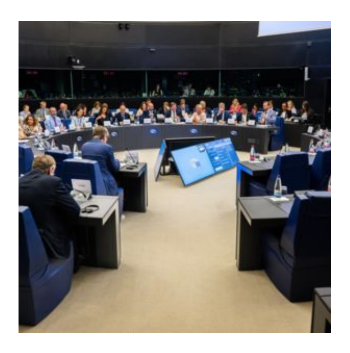
EPP & far-right institutionalising their campaign agai...