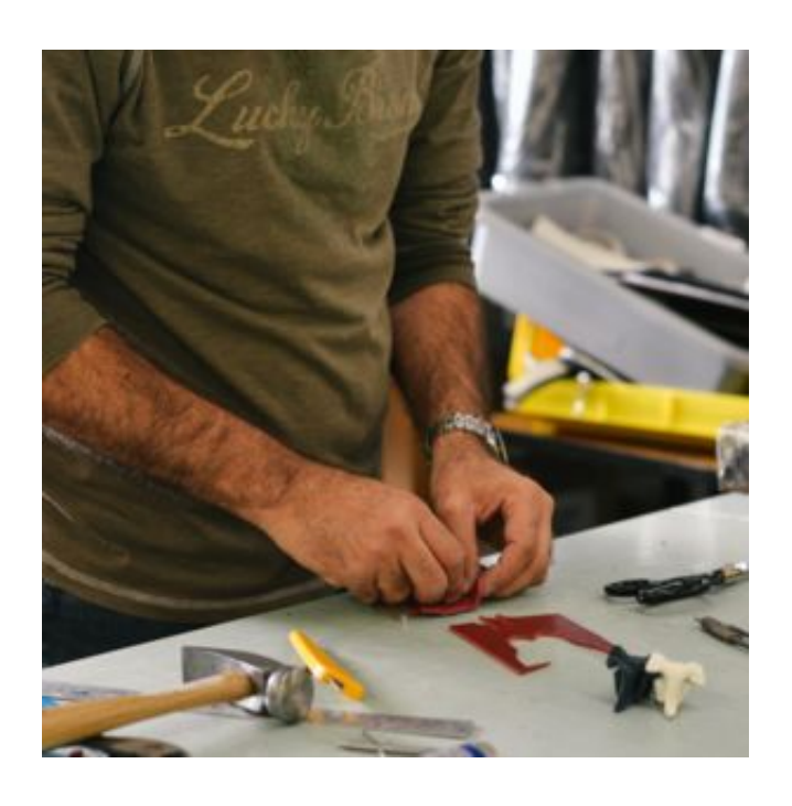
Internal market/Omnibus small mid-caps