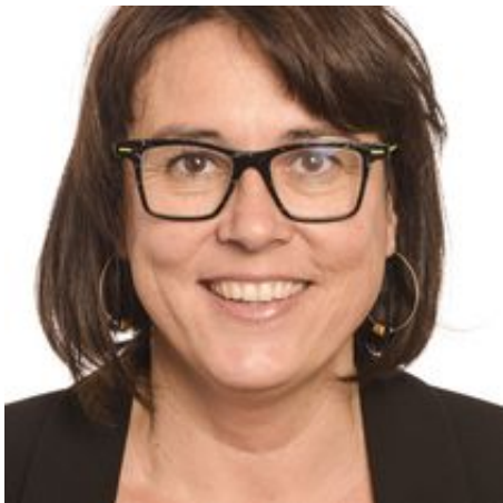
Diana Riba i Giner

EFA President and first Vice President of the Greens/EFA Group