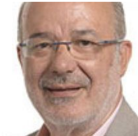
Josep Maria Terricabras

EFA President and first Vice President of the Greens/EFA Group