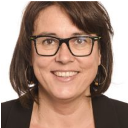
Diana Riba i Giner

EFA President and first Vice President of the Greens/EFA Group