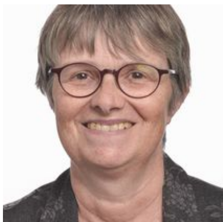
Molly Scott Cato