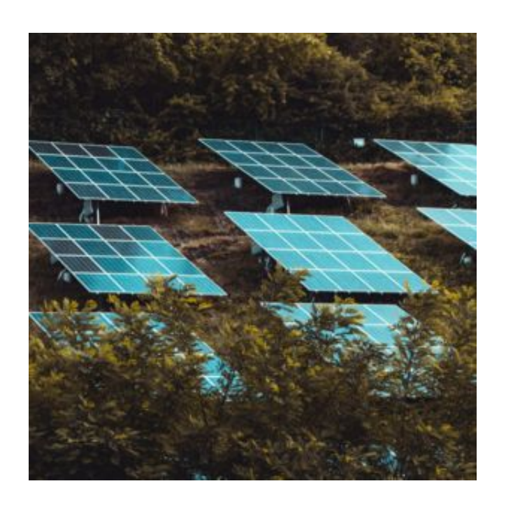
Europe's Green Tech Revolution