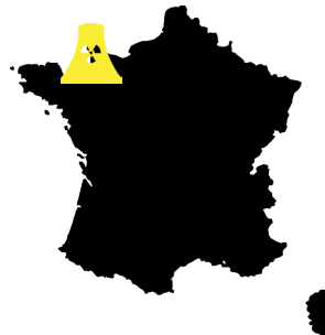
France: Flamanville & le Creusot

In 2015 credit-rating agency Standard & Poor's downgraded TVO to BBB-, just above 'junk' status, with a continuous negative outlook referring inter alia to the risk of increasing costs related to Olkiluoto 3.