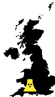
UK: Hinkley Point C (HCP)

Areva has already accumulated € 5.5 billion in losses, with further losses expected. TVO and Areva / Siemens are locked in a legal battle over the cost overruns. After Areva's technical bankruptcy in 2015, its reactor-building division is likely to be integrated with the French utility EDF.