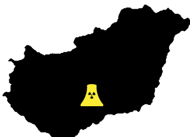
Hungary: Paks II

On the British side, the new 'May Government' gave the final green light in autumn 2016. Officially HCP shall enter into service in 2025, yet considering the immense economic risk for investors and consumers while renewable alternatives are getting cheaper and cheaper, as well as EDF's disastrous financial situation and the pending legal challenges - not to mention the unforeseeable consequences of Brexit - this seems very optimistic.