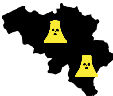
Belgium: Doel and Tihange

In 2012 the reactors Doel 3 and Tihange 2 were switched off after thousands of fine cracks were discovered in their reactor pressure vessels. After a positive assessment by the Belgian nuclear authority regulatory FANC in summer 2013, the reactors went back online, but were switched off again in March 2014 for further tests. Despite the inconclusive results of the following investigations and tests, FANC gave the green light to re-start both reactors at the end of 2015 ( http://www.greens-efa.eu/flawed-reactor-pressure-vessels-in-the-belgian-npps-doel-3-and-tihange-2-15160.html ).