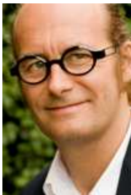
Claude Turmes, Greens/EFA MEP, Vice-President of the Greens/EFA Group in the European Parliament

He wrote many books on Ecology and Peak oil, such as "Sauver la terre", "Petrole apocalypse", or "Antimanuel d'Ecologie".