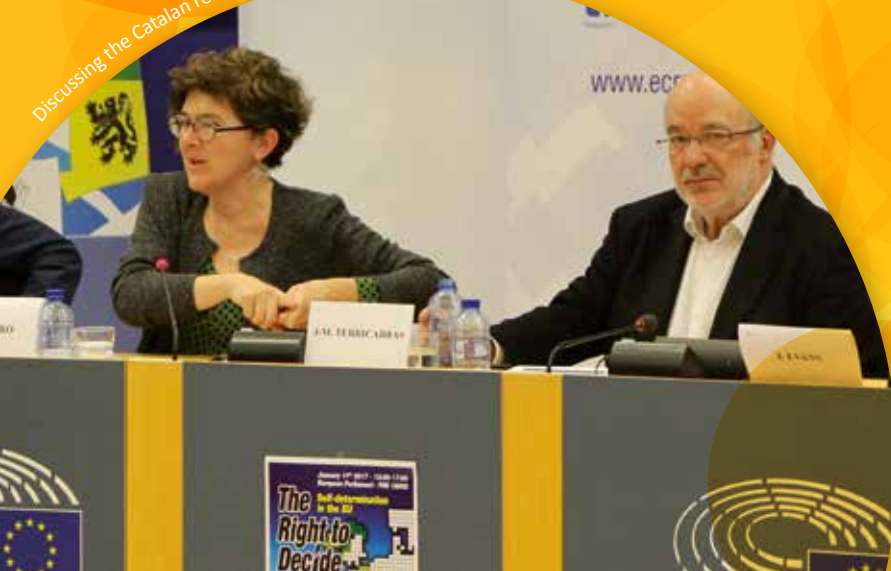
Discussing the Catalan referendum at the European Parliament