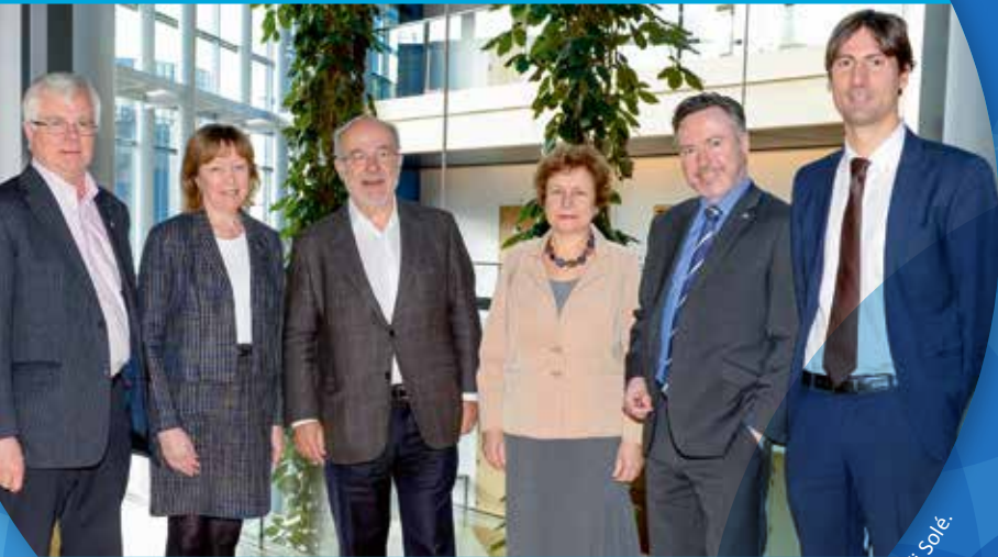
EFA MEPs. Left to Right: Ian Hudghton, Jill Evans, Josep-Maria Terricabras, Tatjana Ždanoka, Alyn Smith, Jordi Solé.